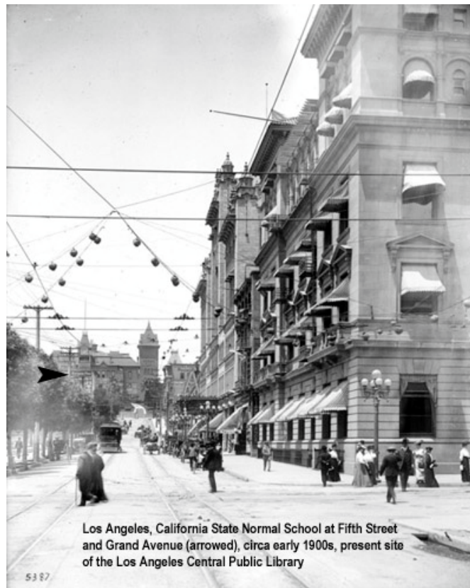
Los Angeles, California State Normal School at Fifth Street and Grand Avenue (arrowed), circa early 1900s, present site of the Los Angeles Central Public Library

Superintendent of Los Angeles City Schools. He was Auditor for the Los Angeles Aqueduct Project, a member of the Los Angeles Chamber of Commerce and held a number of leadership positions in the Southern California Academy of Sciences and its Astronomical Section, including president in 1904-1905.