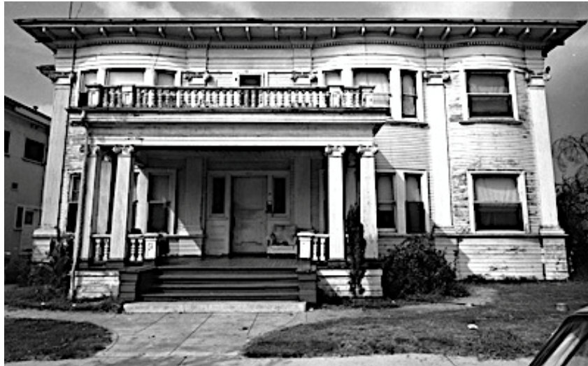
The Bishop home, sans observatory, in 1977, a victim of urban renewal.